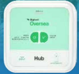
THE OVERSEA HUB